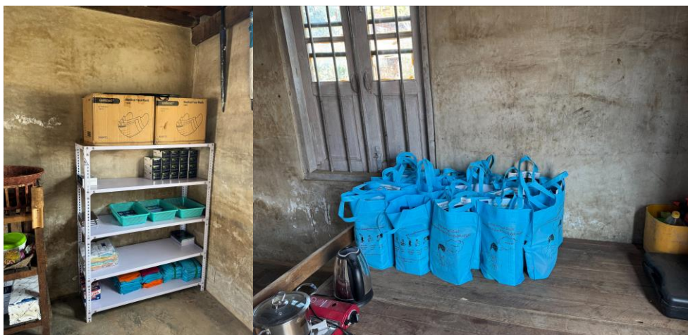
(Stock storage shelf and TB patient promo package)

Hopone township is currently going with form1/2/6 and not feasible to use mobile apps (Vol & Dots Apps) due to internet connections problems at the rural areas/villages.