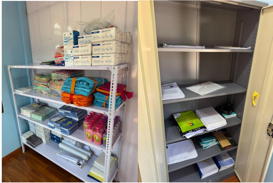
(Lawksawk stock room & cupboard for forms storage)

storage of the stock room and forms (program, finance & MEAL) keeping at the SDP. Lawksawk is still needed to have township mapping and data dashboard for 2025.