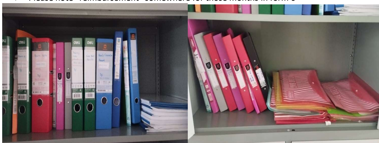
Proper records and reports keeping