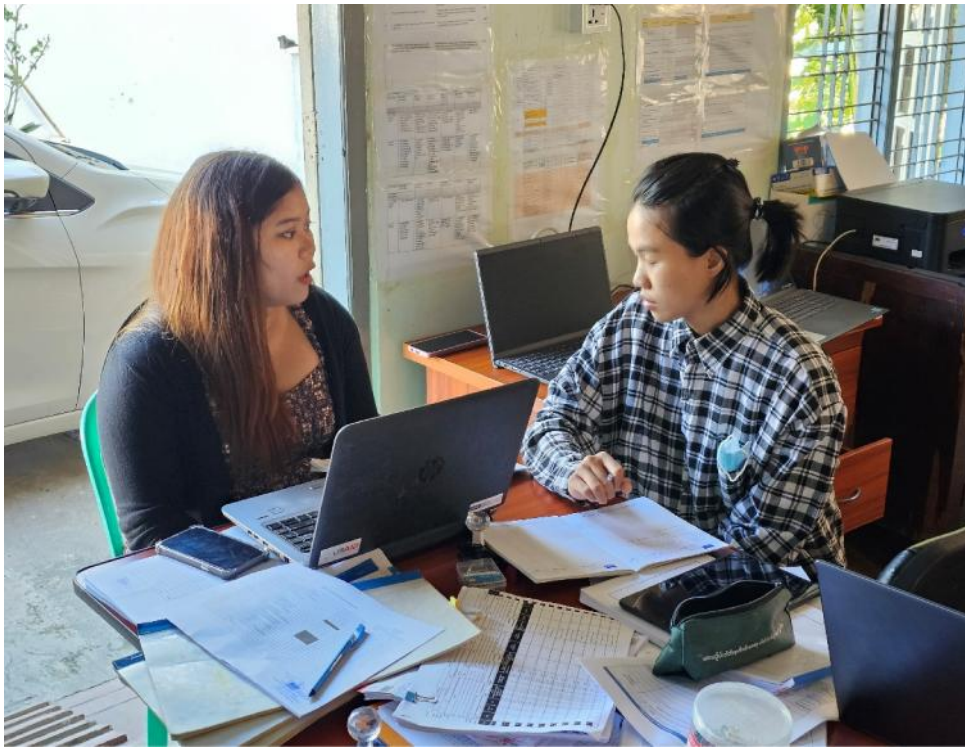
Feedback to FO