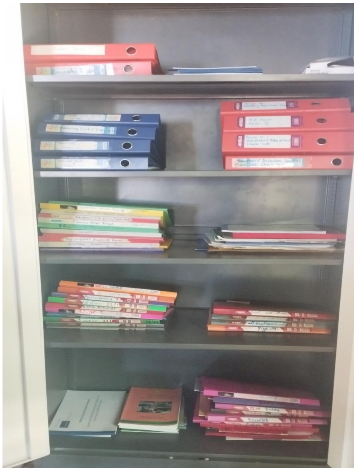
Proper records and reports keeping