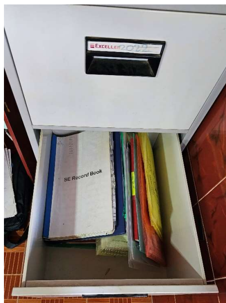
File drawer at Lashio SDP with not organized and crowded