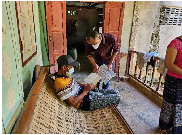
Spot-check for monetary support to 2 DR-TB patients