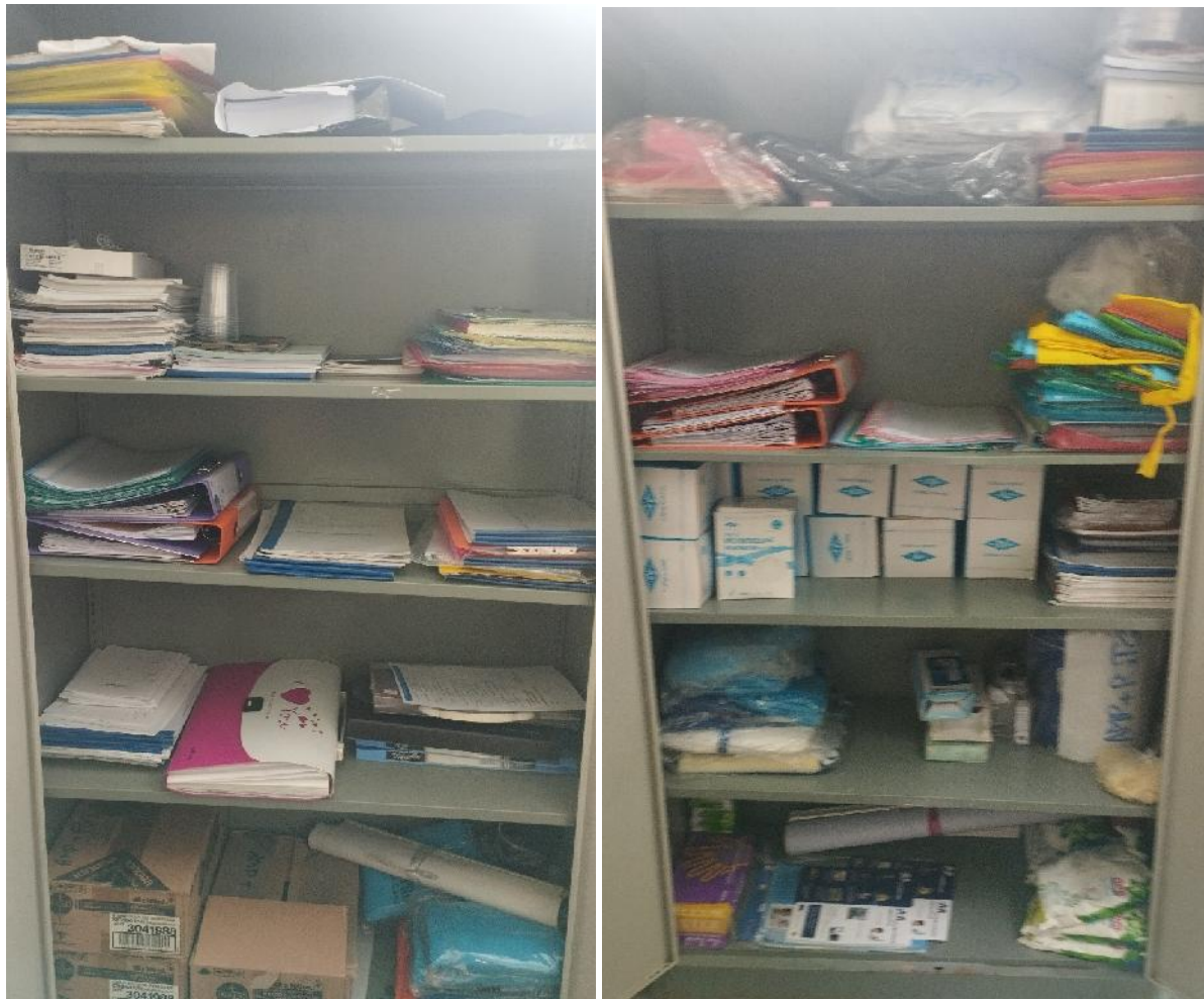
Proper records and reports keeping