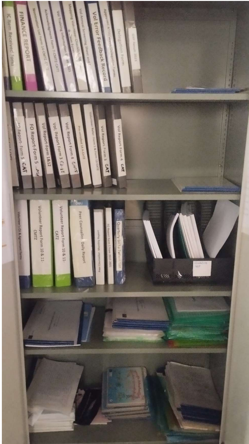
Proper records and reports keeping