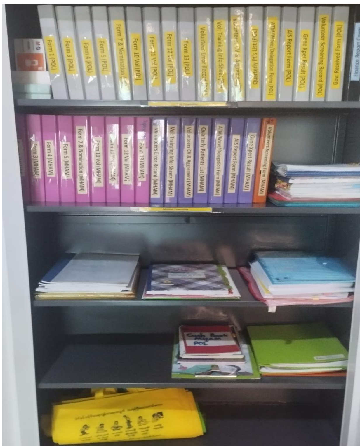
Proper records and reports keeping