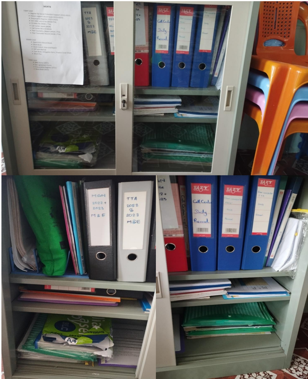
Proper records and reports keeping