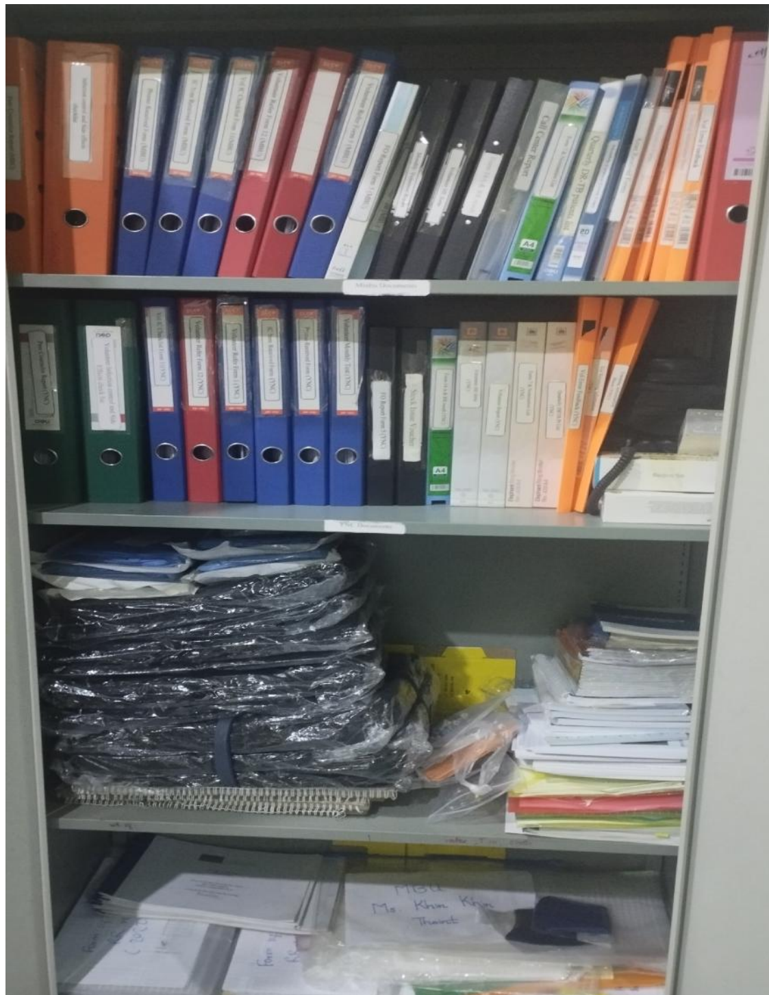
Proper records and reports keeping